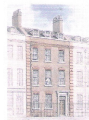
Handel's House, London

Handel premiered three operas in London (1724). His output of music was tremendous. Experience Handel's world in works little-known today!